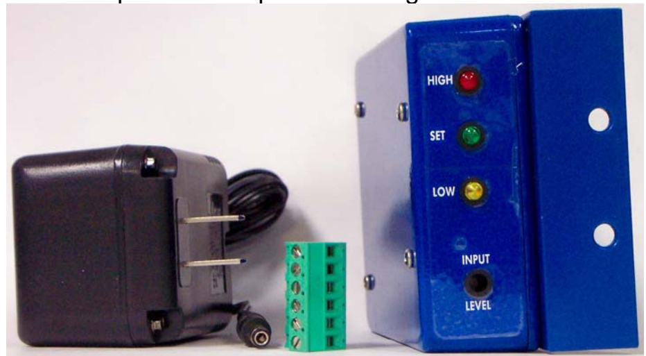
ALM 771 AUDIO LEVEL MASTER CONTROL

Over the years, TV audio has almost been a "necessary evil". Necessary for obvious reasons, and evil because really good control systems were absent and there were many other more pressing problems to solve. Cable has grown and with that, subscriber expectation of professional grade video and audio.